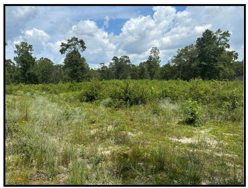
1 Typical view of the proposed mine site facing east.