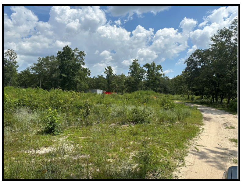
2 Typical view of the proposed mine site facing south.