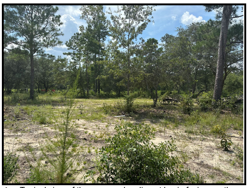
4 Typical view of the proposed sediment basin facing south.