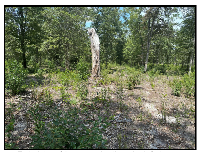
3 Typical view of the proposed sediment basin facing east.