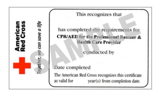
Figure 4. Military Training Network (MTN): BLS for the Healthcare Provider