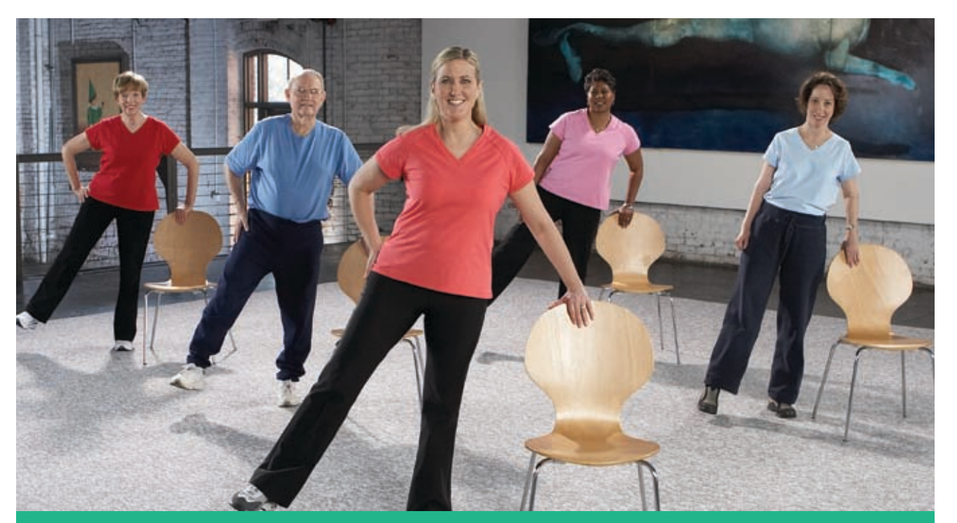
The Arthritis Foundation Exercise Program is tailor-made for people with arthritis.